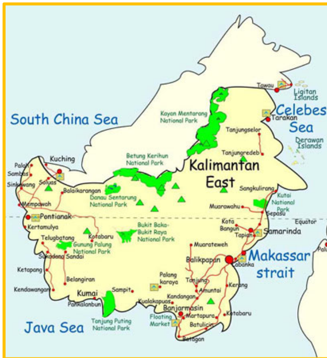
Figure 1 – East Kalimantan

As of the date of this statement, CBM Asia Development Corp (“CBM Asia” or the “Company”), has no reserves and therefore, no related future net revenue.